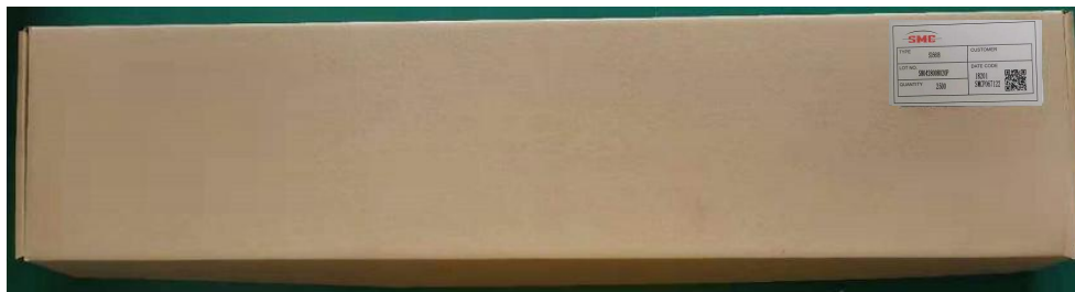
Fig.1- Tube pack for QC3Q